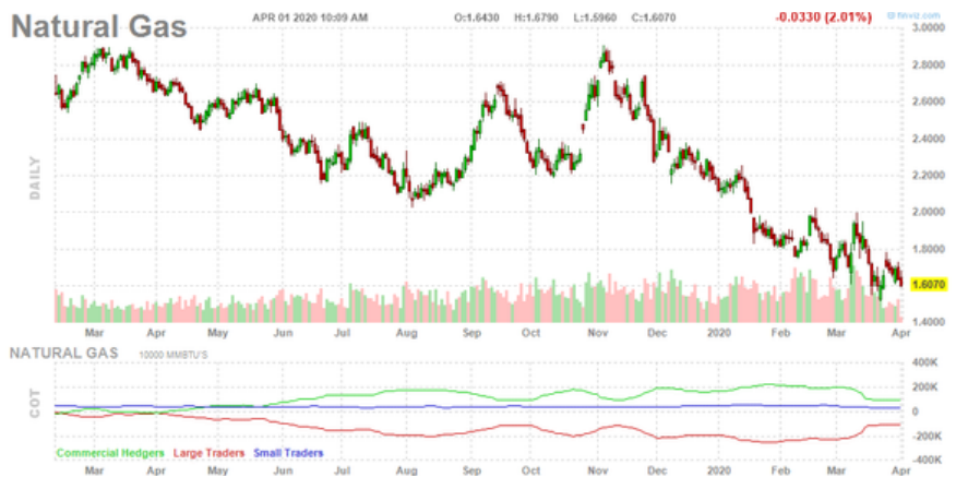
Natural gas price as of 1 April

Because natural gas is the largest source of energy, energy and natural gas pricing are closely related. While sparked by unfortunate events, the natural gas market is bouncing off of the lowest adjusted-for-inflation price in history, presenting businesses an opportunity to lock in greatly reduced energy rates for up to 5 and even 6 years in the future.